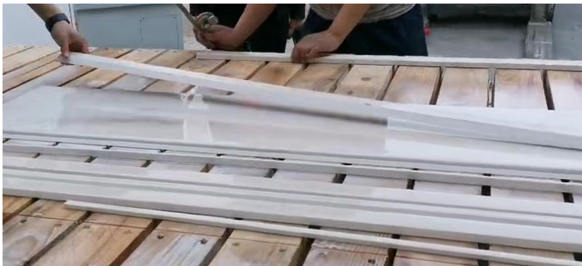
Narrow strip cutting, the cutting surface is smooth and the fixed angle cutting has